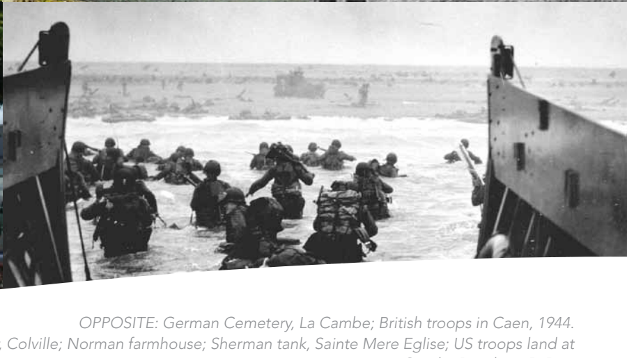
OPPOSITE: German Cemetery, La Cambe; British troops in Caen, 1944. ABOVE: US Cemetery, Colville; Norman farmhouse; Sherman tank, Sainte Mere Eglise; US troops land at Omaha Beach on D-Day. NEXT PAGE: Airborne troops prepare to board their plane before D-Day; German bunker, Pointe du Hoc.